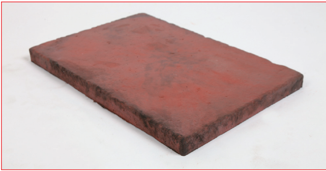
Aged Quarry Red